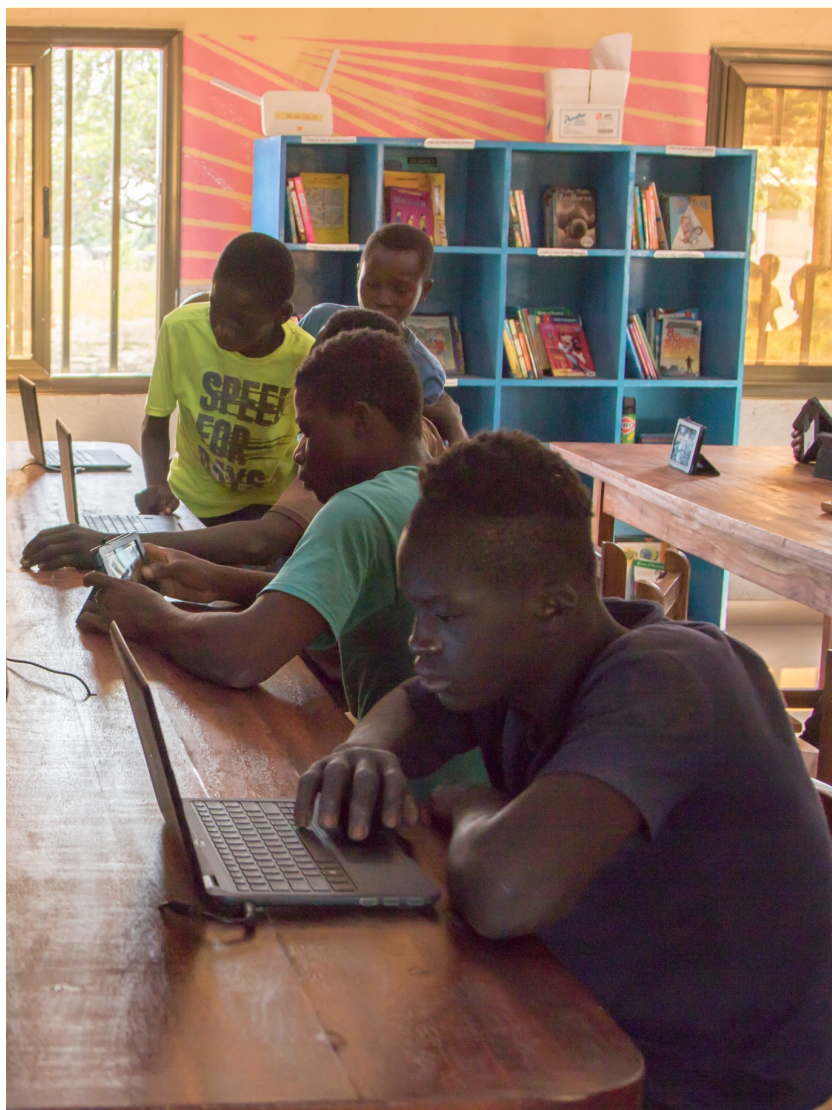
KAFO 2023 ANNUAL REPORT